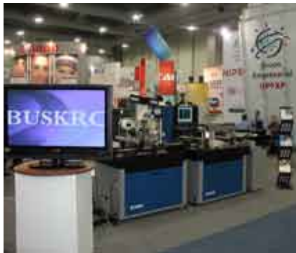
Buskro's first show in Mexico at Expographica in May

Meanwhile at OnDemand and Mailcom, Buskro will demonstrate a new TIJ wide swath high quality printer called Hyperion 8600 . With 8.5" of print the Hyperion will print a full page of variable text, graphics or images on the fly at resolutions up to 600x900dpi. The Hyperion printing system promises to offer customers very high quality at true production speeds (400 ft/min) in line or on the web. The system is in beta testing and due for delivery in late fall 2007.