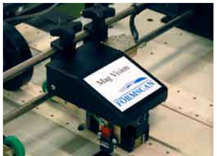
The Eclipse Scanner