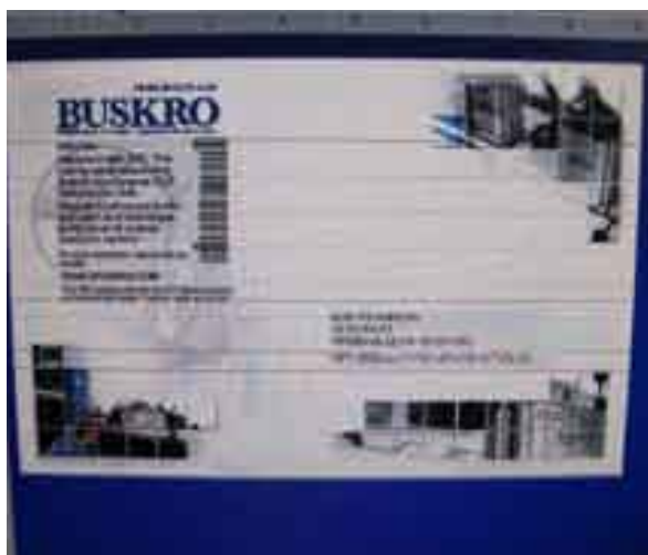
Compose 8 with IMB Barcode