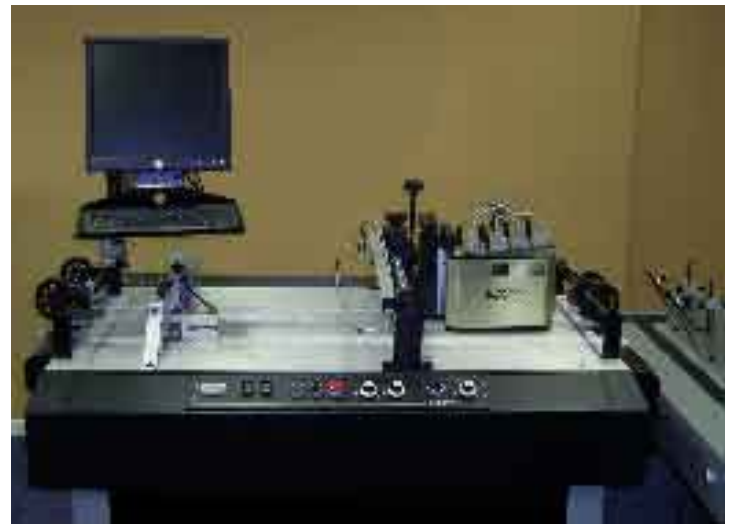
The Eclipse System

The Buskro UK division plans to increase its marketing from this summer in a bid to win more UK customers. Buskro USA plans a joint showing of Eclipse at Graph Expo in Chicago in September. It will be introduced to Europe at Mailingtage in Germany in June.