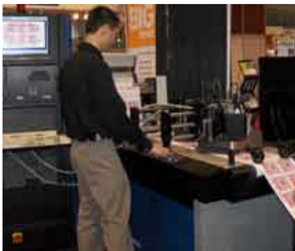
Hyperion 8600 on show at On Demand