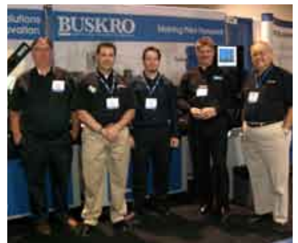
The team out west at Print Fest in Long Beach C.A.