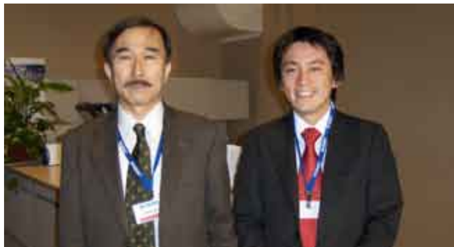
Dealers from Japan at meeting