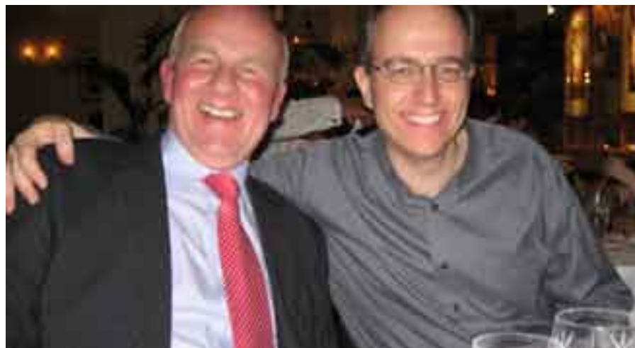
UK & Global Managers celebrate

Buskro International formed Buskro Global in Barbados on April 2nd 1997. It was set up to manage the world-wide sales and marketing of Buskro products outside of Canada and has responsibility for the pricing and marketing strategies and execution for the company. To mark the celebration of its anniversary Buskro Global hosted a dinner and meeting with some of its dealers at the end of March in the UK.