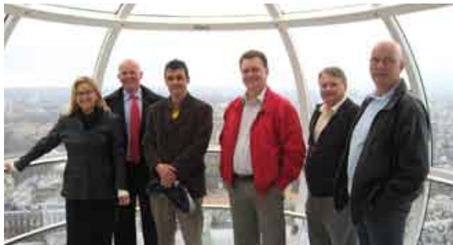
Dealers and guests take a spin on the London Eye