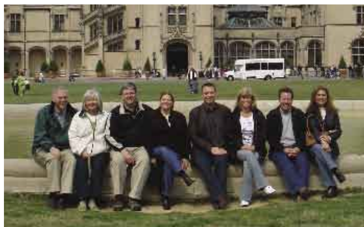
North American Top Sales Winners get a weekends' break at the Biltmore in N. C.